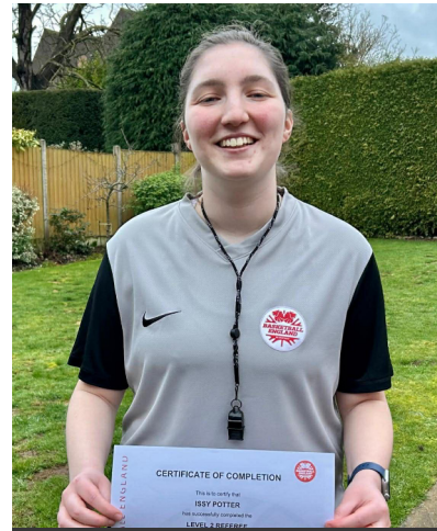
A proud new referee

Issy and Kai remind us: basketball is more than a game. It is a pathway, a classroom, a community. For those who embrace it fully, it becomes a lifelong source of growth, purpose and pride.